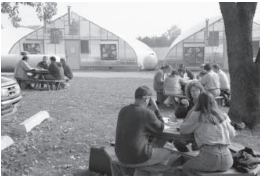
Fig. 4. Break-out groups of teams developing individual nutrient management plans at a typical nursery site visit at the end of each module.

was to develop a course that could be accessed by both resident university students, but also professionals within these industries whenever time was available. After the industry was surveyed (Teffeau et al., 1999), a web-based format was chosen to deliver the course, since nursery and greenhouse professionals are widely dispersed throughout the state, but most often