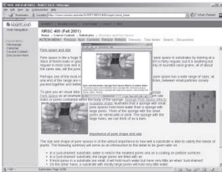
Fig. 3. An example of a course-content page with text, visuals and hyperlinks to short video-clips on the course, Water and Nutrient Management Planning for the Nursery and Greenhouse Industry.